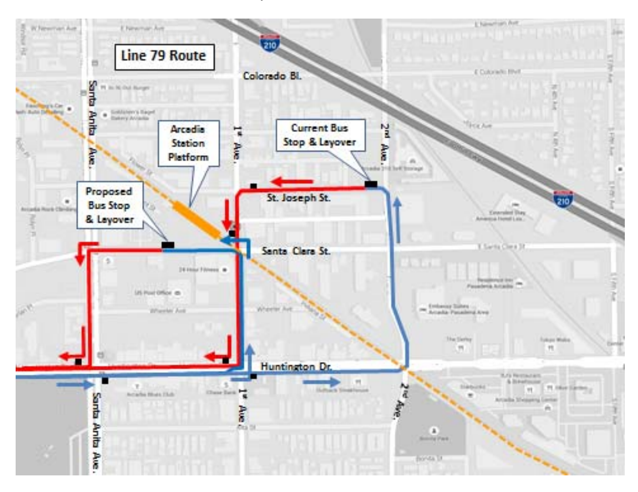
Figure 3 Route 79

will be eliminated. A new stop will be added on Santa Clara St. midblock between Santa Anita Av. and 1<sup>st</sup> Av. to more directly serve the Arcadia Station.