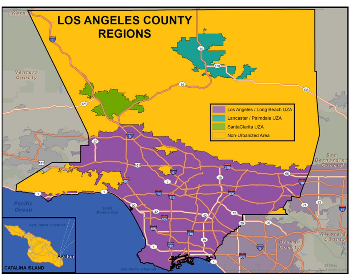
Exhibit 1: Los Angeles County Urbanized and Nonurbanized Areas

Beach-Anaheim UZA, about $0.4 million to the Lancaster-Palmdale UZA, and about $0.3 million to the Santa Clarita UZA. The funds are allocated based on the number of seniors and individuals with disabilities in large urbanized areas. The funding that is available for large UZAs in Los Angeles County represents about 32% of all Section 5310 funds apportioned to large UZAs in California and about 24% of all Section 5310 apportioned to all areas in the state (including small UZAs and nonurbanized areas). Short-term extensions of MAP-21 partially funded the Section 5310 Program in FFY2015 at the same funding level authorized for FFY2014. It is anticipated that any additional short-term extension(s) of MAP-21 or new long-term federal reauthorizing legislation would: i) fund the Section 5310 Program at about the same annual funding level authorized by MAP-21; and ii) continue to require that projects selected for Section 5310 funding awards are included in a Coordinated Plan, while maintaining the flexibility in how projects appear (i.e., strategies, activities, and/or specific projects).