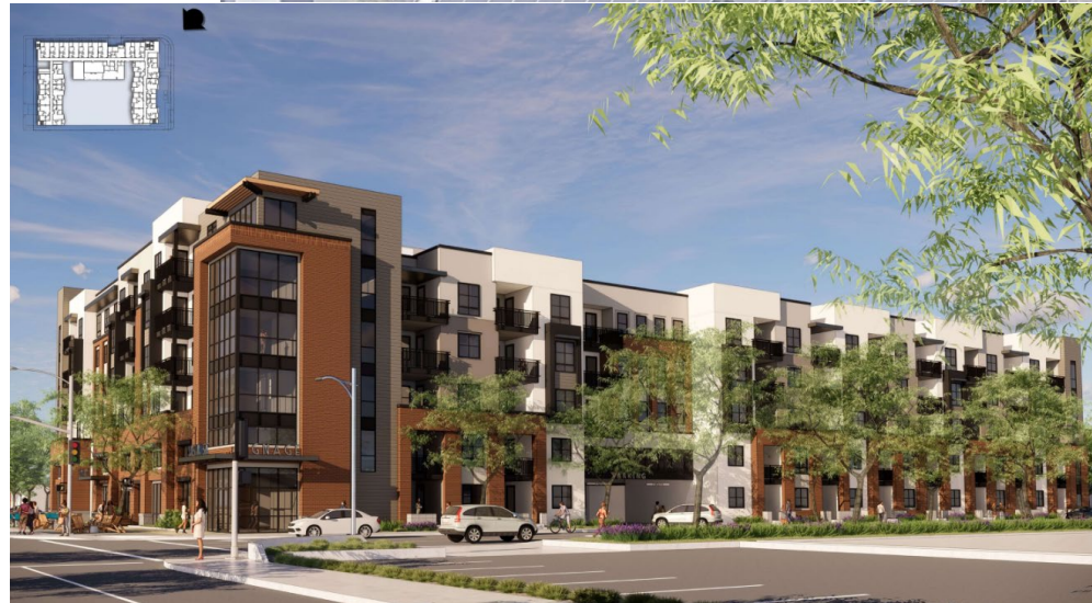
View from the corner of Highland Ave and Fasana Rd facing southwest