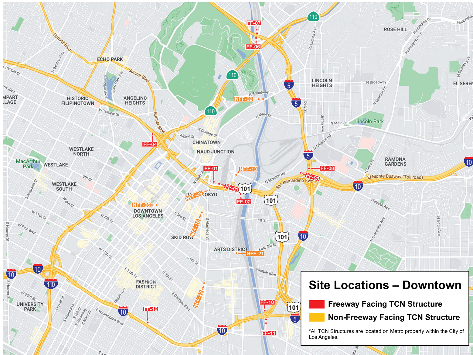
Figure 3 Regional Project Location Map – Downtown