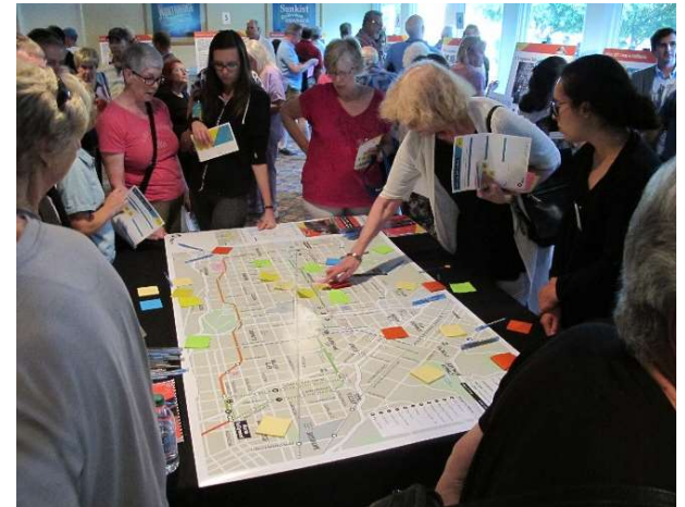
August 12, 2019 Northridge Meeting