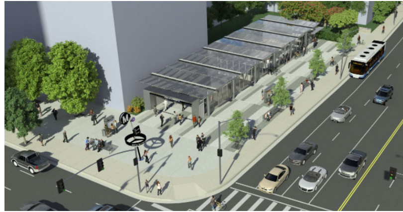
Purple Line 2 Station

Based on the existing demographics, each station was categorized according to the aforementioned CTOD/FTA typology defined largely in terms of TOD amenability and TOD density guidelines. To develop the TOD buildout scenario for each station, the existing densities for residential and commercial zones were increased to reach the higher recommended TOD density (specifically, recommended residential dwelling units/acre and commercial FAR) for that category. In general, where additional land is required to accommodate the new density, industrial zones (and vacant land, where available) were converted to residential and commercial uses. For each station, both general plans and specific plans for local jurisdictions were consulted for specific land use and zoning guidelines. With few exceptions, the TOD densities applied were within the maximum density allowed by the localities for a given land use and zoning specification.