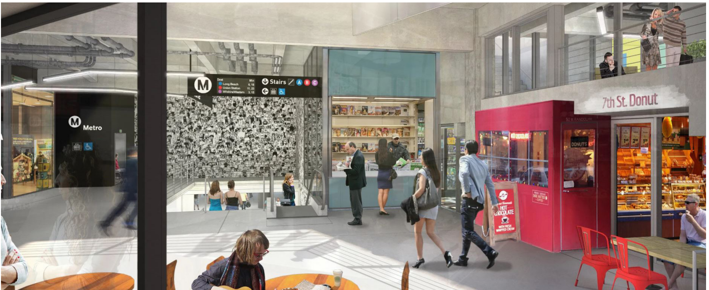
7th Street Metro Train Station Rendering.

such that developers' contributions kick-in later in the development phase when their risks are lower and their willingness to pay is higher.