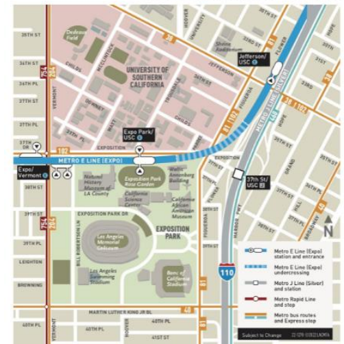
Metro Service to the Coliseum