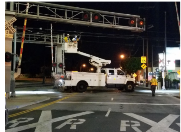
Traction Power Staff On-Site