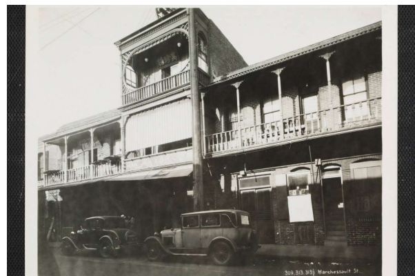
Man Jen Low Cafe at 309 1_2 Marchessault Street.