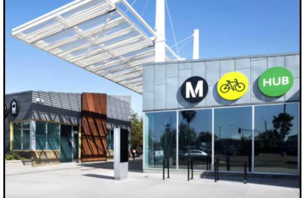
Above: eLock Technologies Lockers, as seen at UCLA – Metro Bike Lockers Retrofit with Digital Upgrades and Daily Parking Option