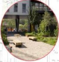
RESIDENT ENTRY COURT