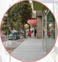
NEW HAMPSHIRE STREETScape