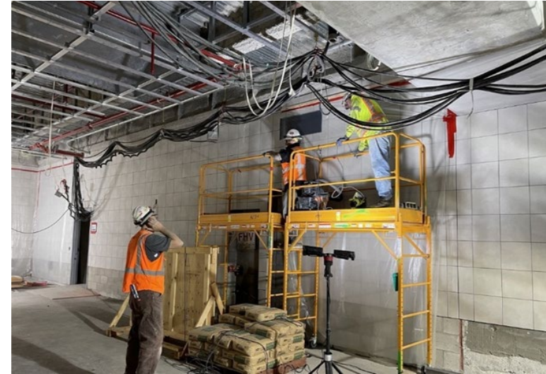
Wilshire/Fairfax Station Porcelain Tile Installation