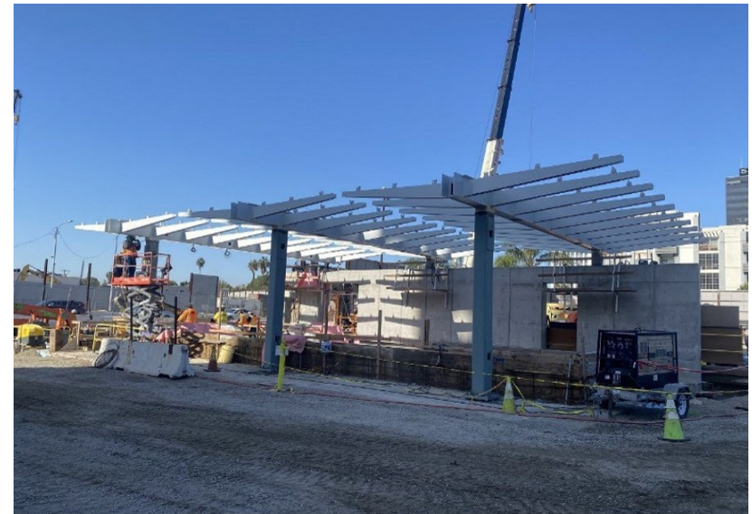
Wilshire/La Brea Station Canopy