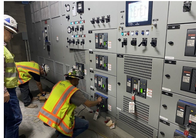
Wilshire/La Cienega Station LFAT Testing