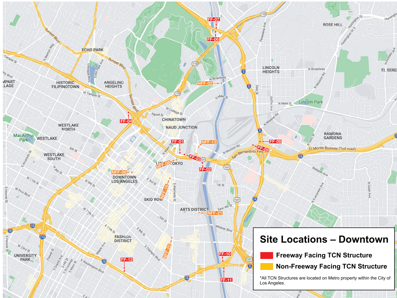
Figure -3 Regional Project Location Map – Downtown