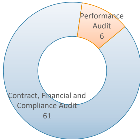
Summary of Audit Activity by Department Reporting Period July 1, 2022 – September 30, 2022