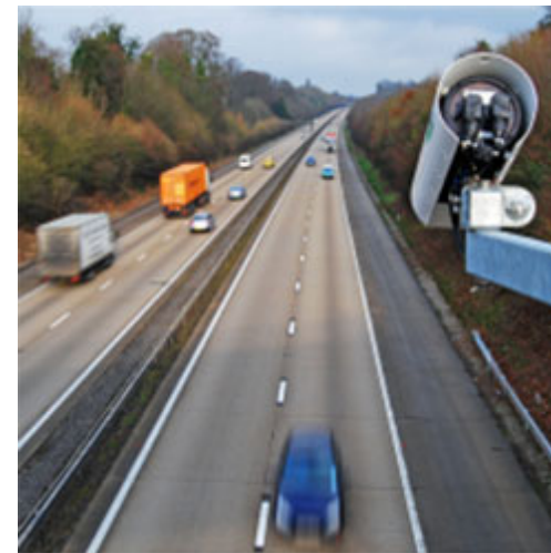
High Speed Wireless Cameras