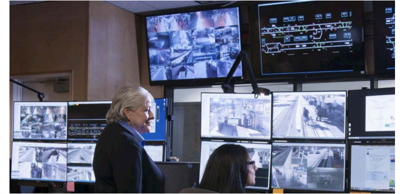
LA Metro's Emergency Security Operations Center