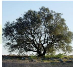
Quercus engelmannii Engelmann Oak