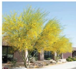
Cercidium 'Desert Museum' Desert Museum Palo Verde