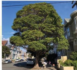
Lophostemon confertus Brisbane Box