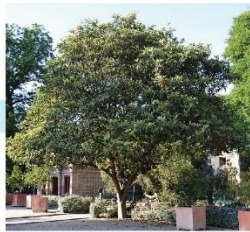
Eriobotrya japonica Japanese Loquat