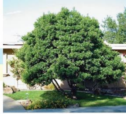
Flaeocarpus decipiens Japanese Blueberry Tree