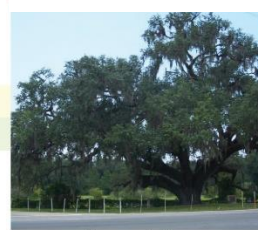
Quercus virginiana Southern Live Oak