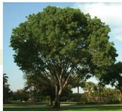
Dalbergia sissoo Indian Rosewood