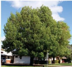
Fraxinus uhderi Evergreen Ash