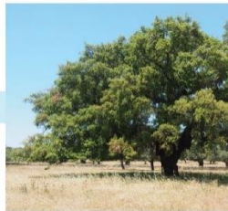
Quercus suber Cork Oak