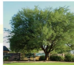
Prosopis chilensis Chilean Mesquite