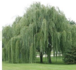
Geijoria paviifolia Australian Willow