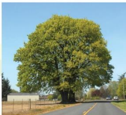
Acer macrophyllum Rigleaf Maple