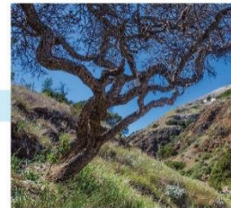
Quercus tomentella Channel Island Oak