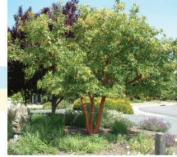
Arbutus 'Marina' Marina Strawberry Tree