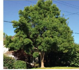
Fraxinus oxycarpa 'Raywood' Raywood Ash