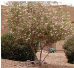
Chilopsis linearis Desert Willow