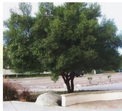
Rhus lancea African Sumac