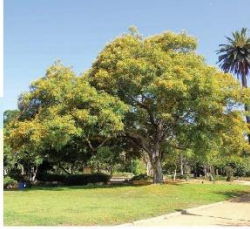
Tipuana tiju Tipu Tree