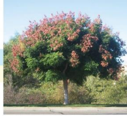
Koelreuteria bipinnata Chinese Flame Tree