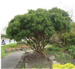
Arbutus unedo Strawberry Tree