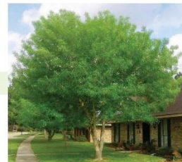
Fraxinus velutina 'Modesto' Modesto Ash