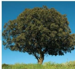
Quercus ilix Holy Oak