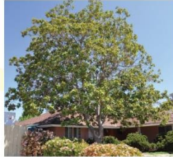
Platanus Racemosa Western Sycamore