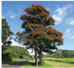
Spathodea campanulata African Tulip Tree