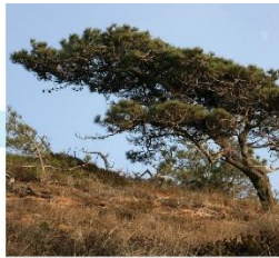
Pinus torreyana Torrey Pine