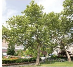
Platanus acerifolia 'Colombia' London Plane Tree