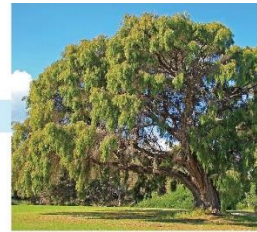
Agonis flexuosa Peppermint Tree