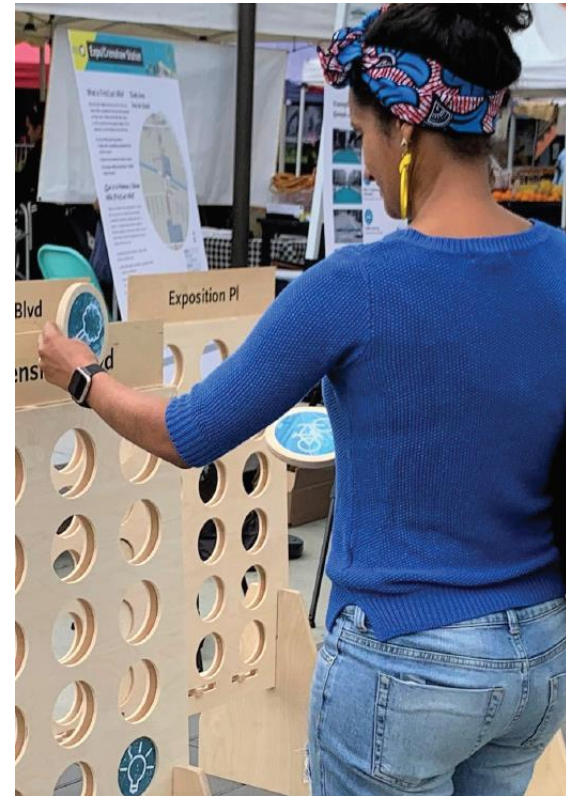
Pop-up event at Crenshaw Farmers' Market