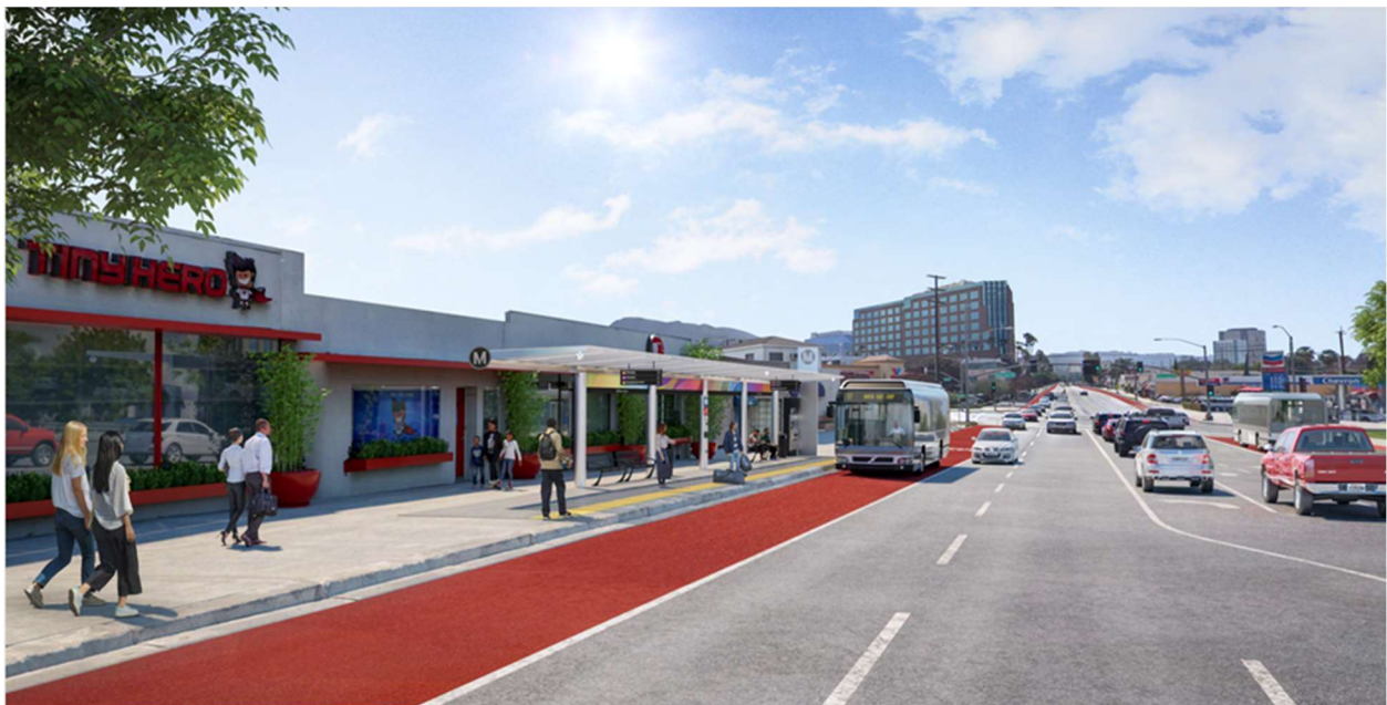
Figure 2: BRT on Olive Avenue in Burbank