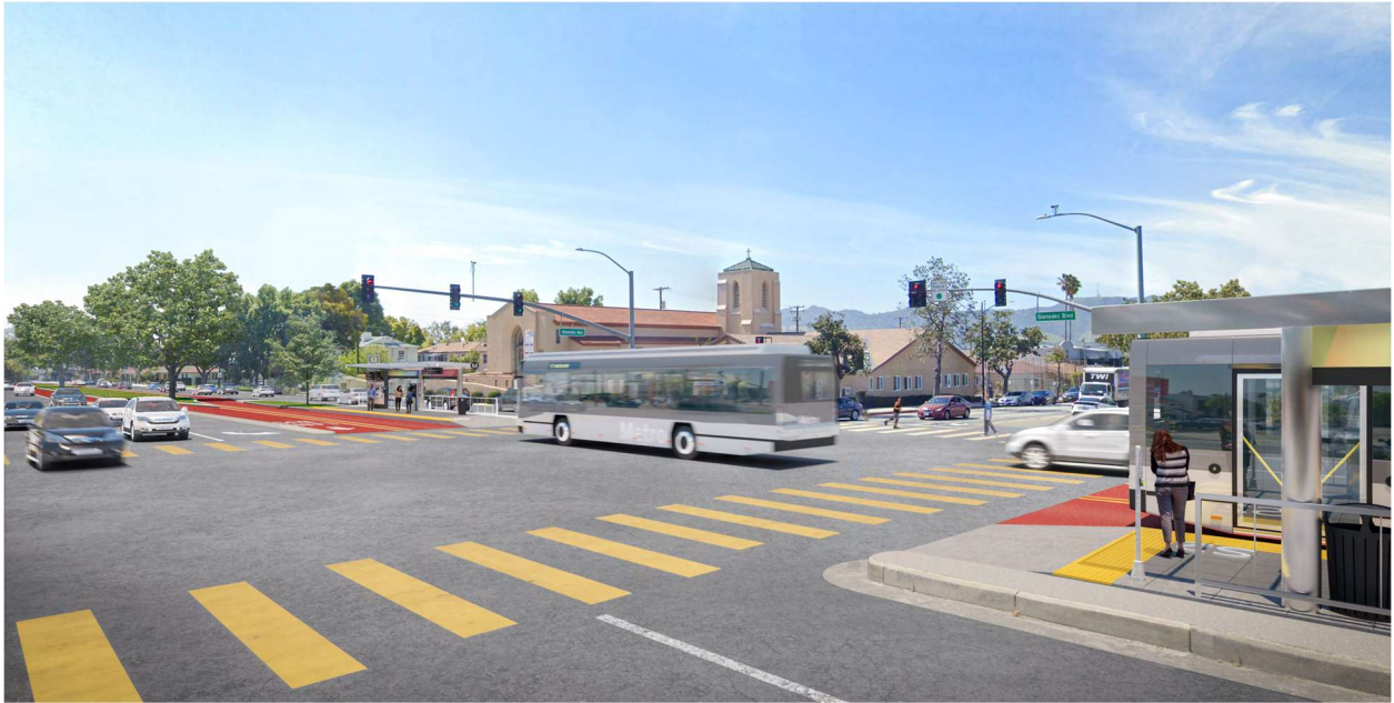
Figure 3: BRT on Glenoaks Boulevard in Glendale