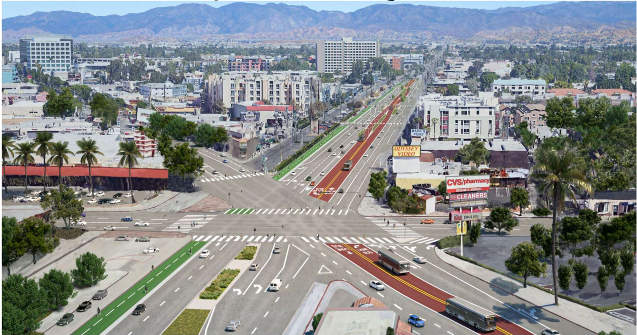
Figure 1: BRT on Vineland Avenue and Lankershim Boulevard in North Hollywood