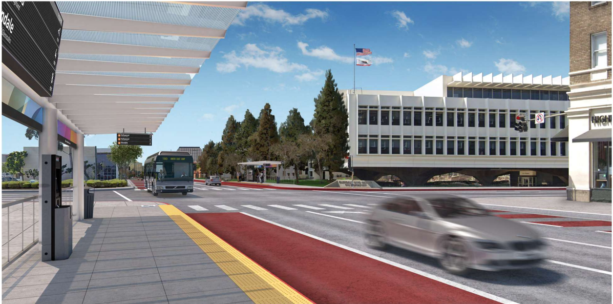
Figure 4: BRT on Broadway in Glendale