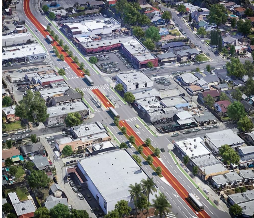
Figure 6: BRT on Colorado Boulevard in Eagle Rock, east of Eagle Rock Boulevard – design option maintaining all travel lanes