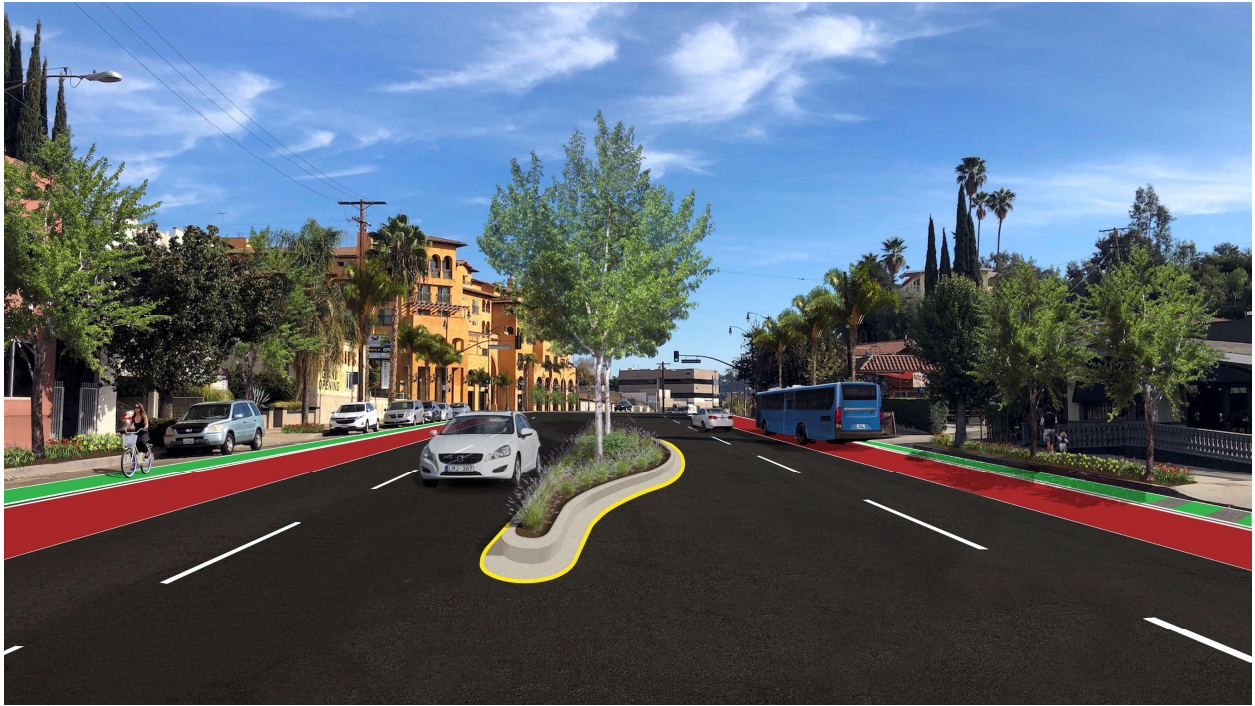
Figure 5: BRT on Colorado Boulevard in Eagle Rock, west of Eagle Rock Boulevard