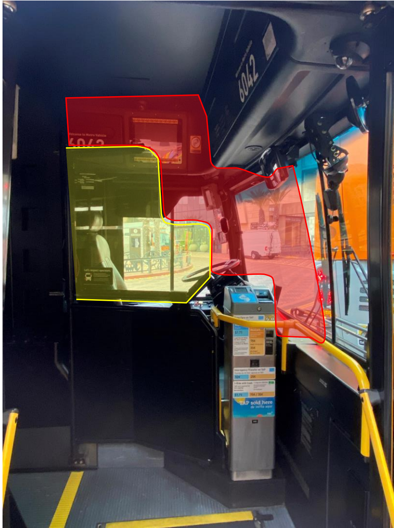
Current Barrier Design