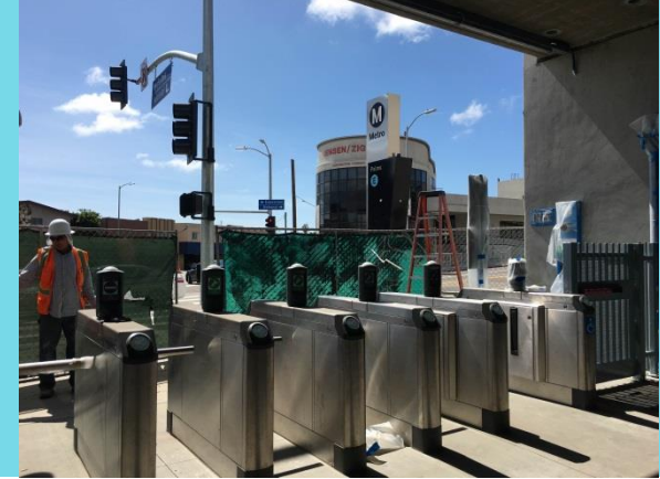
Westwood/ Rancho Park