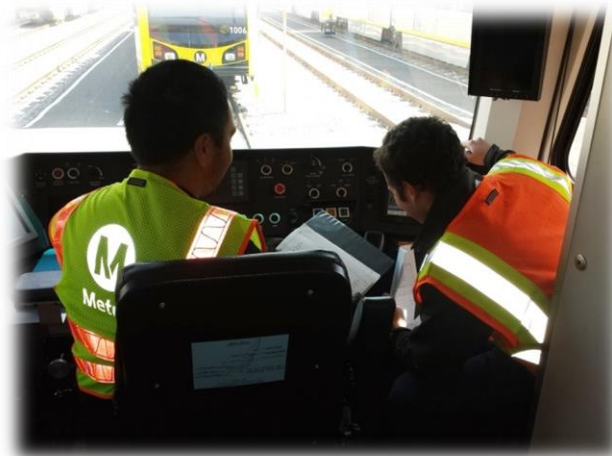
The new P3010 car testing