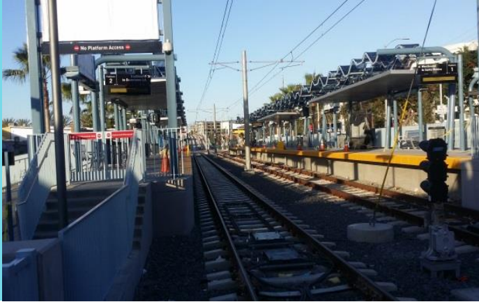
26 th Street/ Bergamot