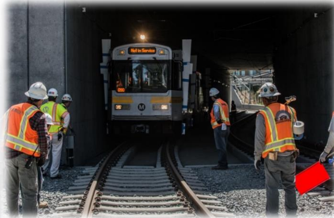
Clearance Train Testing inside the I-10 Box near at the Northvale Trench