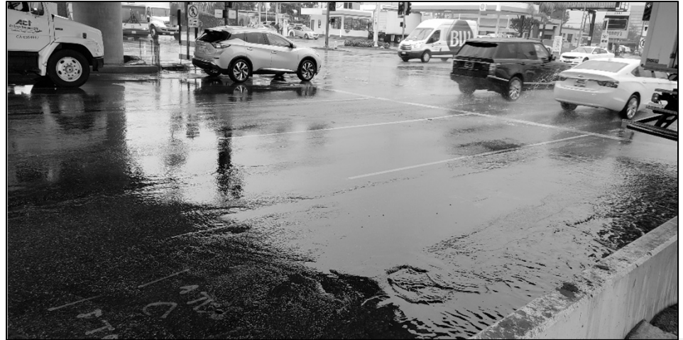
Aviation/Century Blvd. Ponding at Median Design Issue