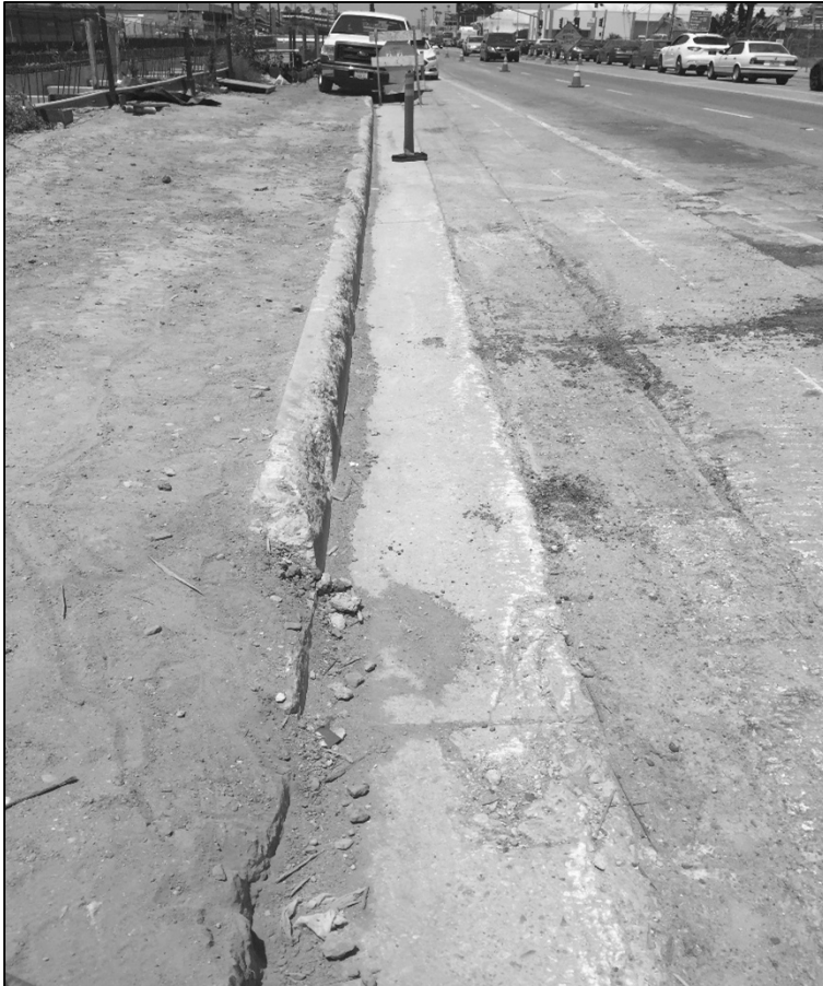
Aviation/104 th St. Damaged Curb and Roadway NNC 043-0818