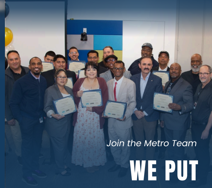
Join the Metro Team