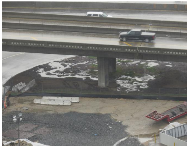
Union Station Box