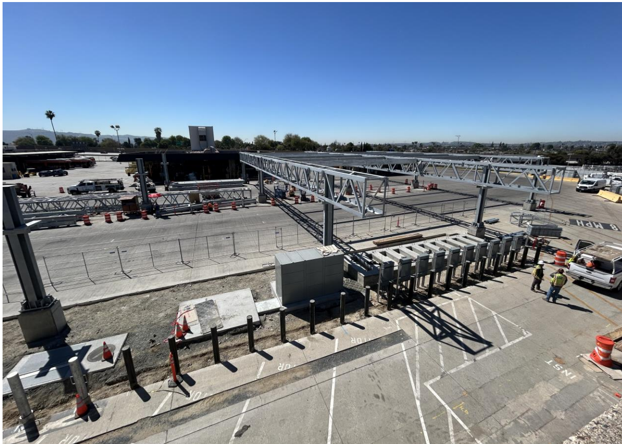
Photo: Progress at Division 9