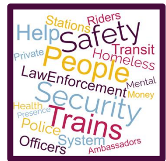
Chief Safety Office

Chief Safety Office mostly received concerns about safety on the system due to drug use, mental health, and unhoused prevalence, code of conduct enforcement, and lack of camera infrastructure. In response, the CSO has proposed an increase in Metro Transit Security Officers, and funding in the Public Safety Analytics program. CSO is conducting a feasibility study on implementing a Metro owned police force. The team continues to work on receiving additional funding for camera infrastructure.