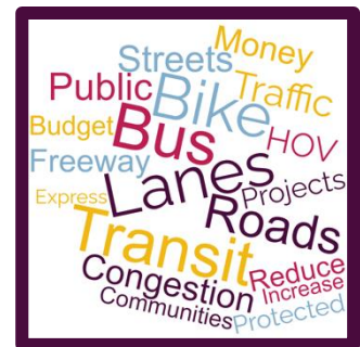
General Planning & Programs

For the General Planning & Programs, the top concerns are to increase public transit options in both bus and rail, increase dedicated bus lanes, and more protected bike lanes. In response, Planning & Programs have increased the Bike Connectivity Improvements budget and is ramping up the 4 pillar projects that are on schedule: Green Line, Sepulveda Transit Corridor, West Santa Ana Branch, and Eastside Extension Phase 2. Projects such as the Broadway BRT and Crenshaw Northern Extension are in progress.