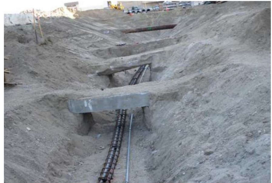
Underground utility work

The Measure R is designated for the Project in the sales tax ordinance, and there are sufficient funds available.