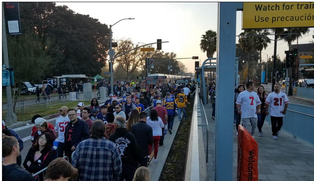
Customers boarding at Expo Park/USC Station