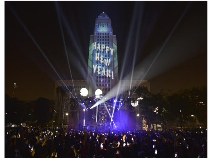
NYELA Grand Park