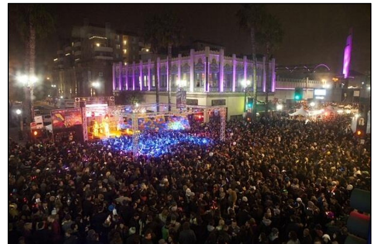
Long Beach NYE at Rainbow Harbor