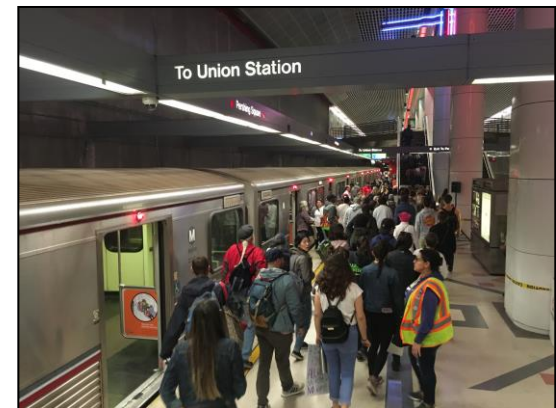
Riders exiting at Pershing Square for the Women's March Saturday, January 19, 2019