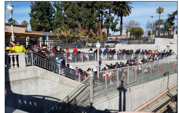
Memorial Park Station / Rose Parade