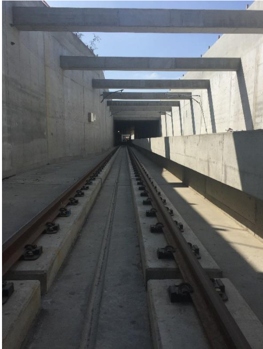
UG-1 - Tunnel section without the cover