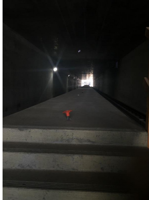
Center walkway at UG-1. Area for lighted handrail, 4-inch wide thermoplastic edge striping, overhead lighting adjustments, power circuits, and redundant circuits