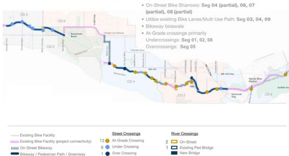
Project Corridor Map