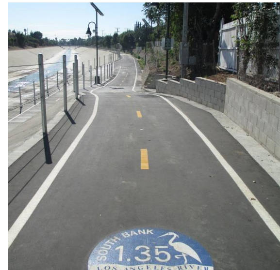
Segment of LA River Bike Path completed in 2014