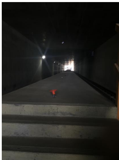
Center walkway at UG-1 Area for lighted handrail, 4-inch wide thermoplastic edge striping, overhead lighting adjustments, power circuits, and redundant circuits