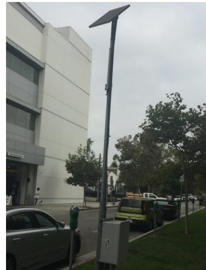
Solar powered instrumentation