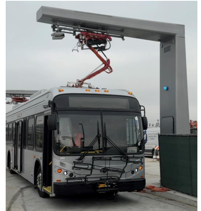
Photo: First charging session at HGTC