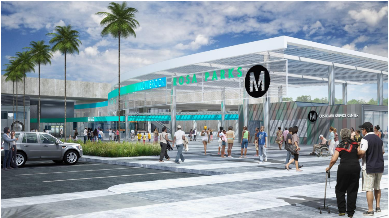
Gateway from Willowbrook and Hahn Plaza