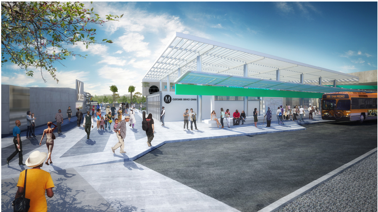
View from proposed Blue Line crossing toward Mobility Hub (left) and Customer Service Center (Right)