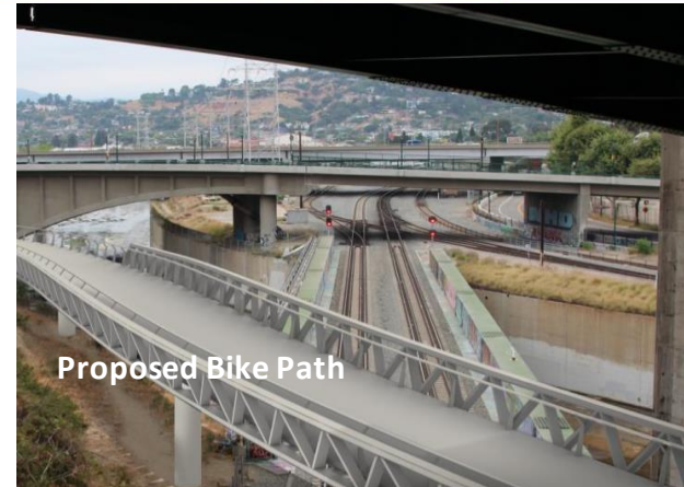
Looking south: near Riverside Drive