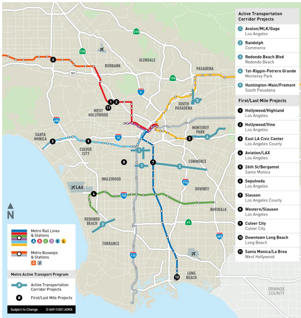
Metro Active Transport Program Cycle 1 Projects (approved in 2021)