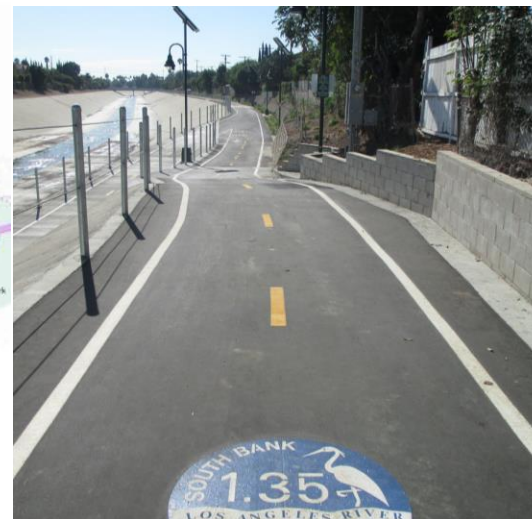
Segment of LA River Bike Path completed in 2014