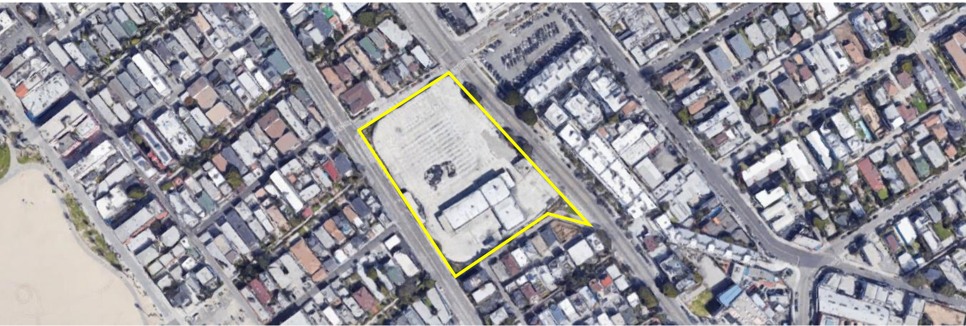
Division 6 Site and Existing Conditions, Google Maps, 2019