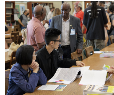
KNE Public Hearing (August 10, 2024)