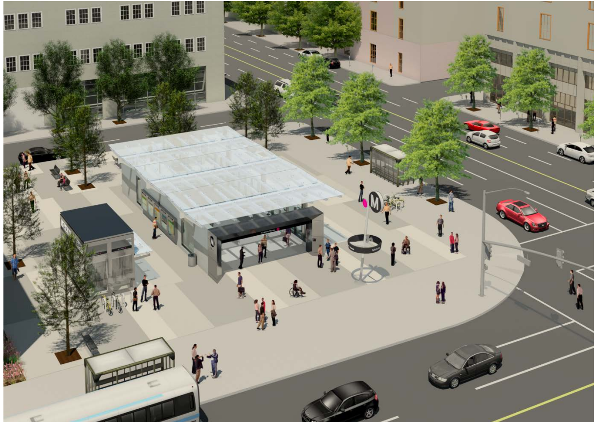
Systemwide Station Design Standard Subway Station Entrance Plaza

Per Board Policy, all new Metro rail and BRT stations shall be in compliance with Metro's SWSD standards, unless otherwise approved by the Board.