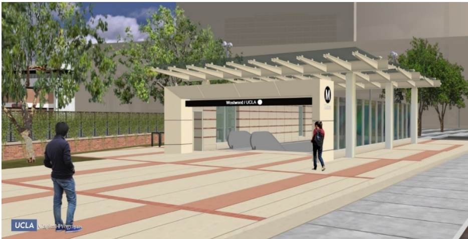
Station entrance with UCLA requested finishes