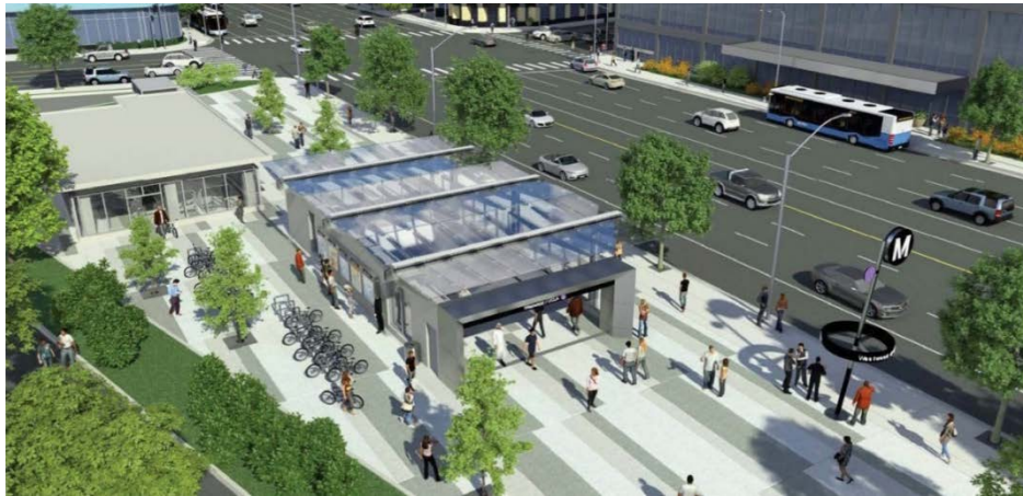
Station entrance with Metro standard finishes