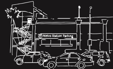
Example Transit Mobility Hub (Chatsworth Station)