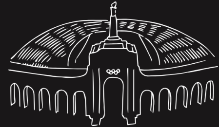
Example Venue Station (Expo/USC Station)