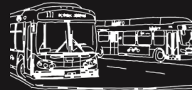
Park-and-Ride (Location TBD)