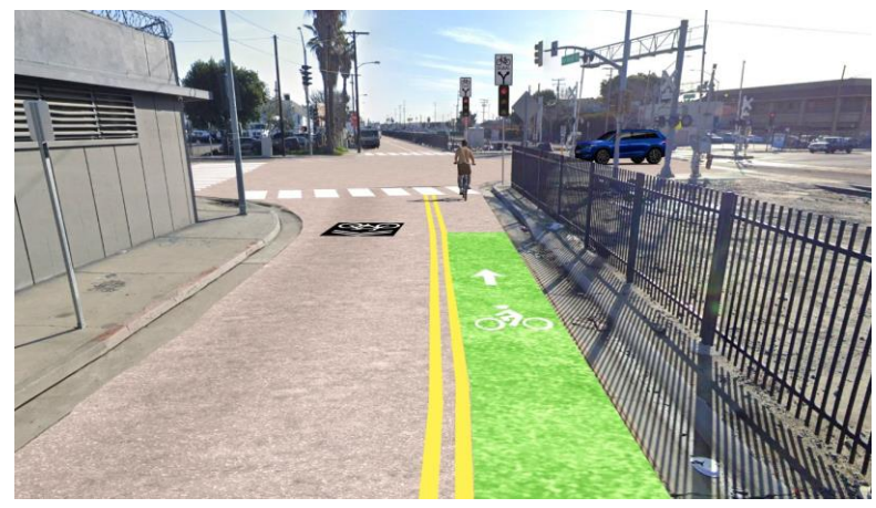
Slauson Ave to Holmes Ave

> Key elements include dedicated on-street bike lanes (3.5 miles), bike routes (1.3 miles sharrows), shared-use path (1.1 miles), ADA curb ramps, signal improvements, high-visibility crosswalks, and pedestrian-scale lighting