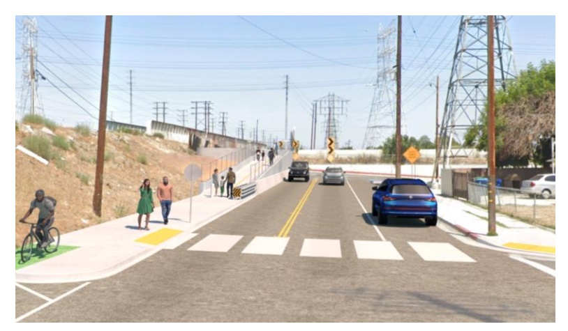
LA River Bike Path Connection