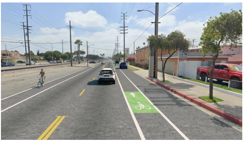
State St to LA River