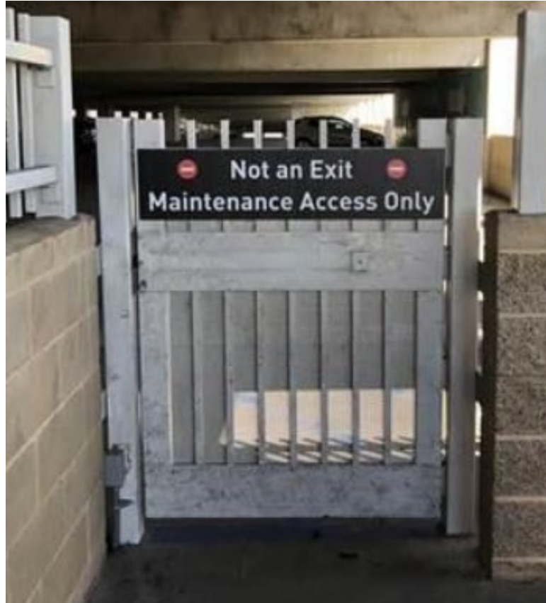
Before: Legacy ESG with easy access to the push bar for determined fare evaders