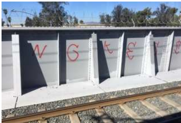
Figure 2. Paint-Out Graffiti Tags On the Gold Line for 6 Days

Paint-Out Graffiti Tags Were Not Reported. Paint-out type graffiti tags found on sections of the Gold Line on Wednesday, January 23 rd had not been removed by Monday, January 29 th . (See Figure 2 below for examples.) We confirmed with the Metro PM that the Contractor had not reported any paint-out tags to him during that week. Two members of the graffiti abatement team told us that they do not report paint-out graffiti tags to their supervisors because they believed it was not their responsibility to do so.