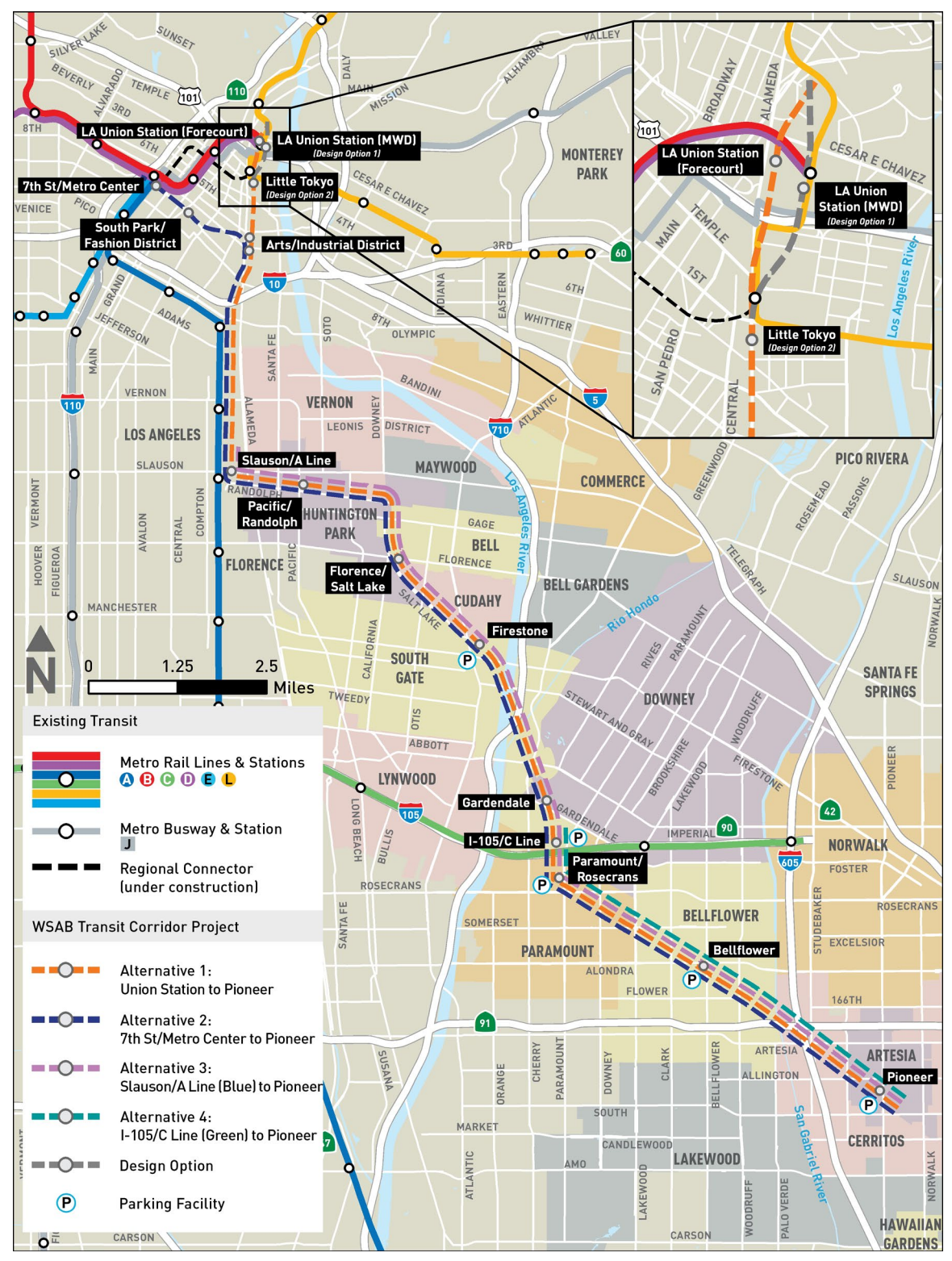
Figure S-2. WSAB Transit Corridor Build Alternatives