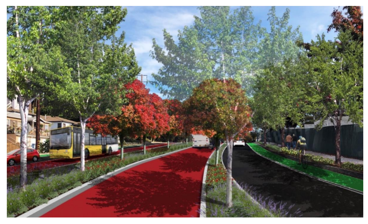
Figure 8: Center-running BRT on Colorado Boulevard at Linda Rosa Avenue in Eagle Rock (design option with single travel lane)