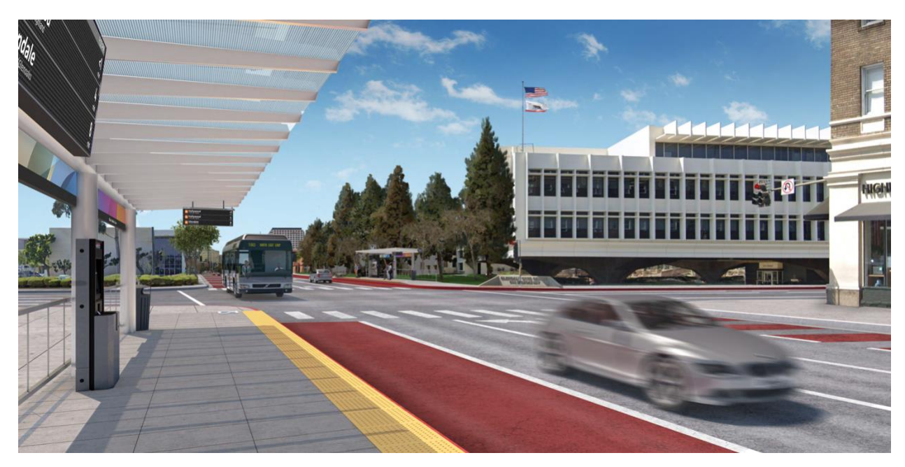
Figure 4: Side-running BRT on Broadway in Glendale