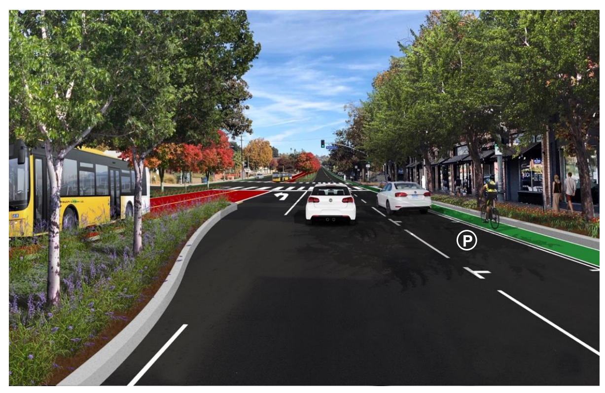
Figure 7: Center-running BRT on Colorado Boulevard at Maywood Avenue in Eagle Rock (design option with single travel lane)