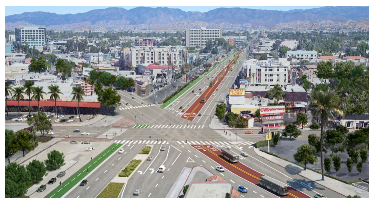
Figure 1: Center-running BRT on Vineland Avenue and Lankershim Boulevard in North Hollywood