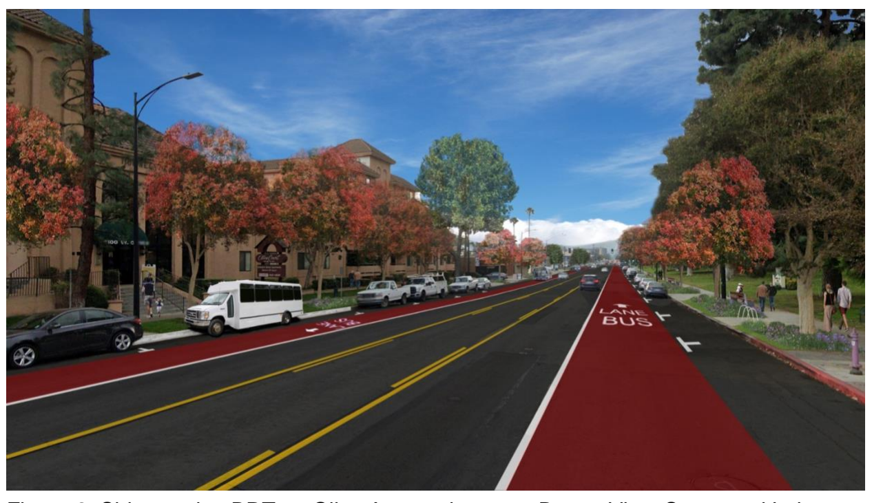
Figure 2: Side-running BRT on Olive Avenue between Buena Vista Street and Lake Street in Burbank