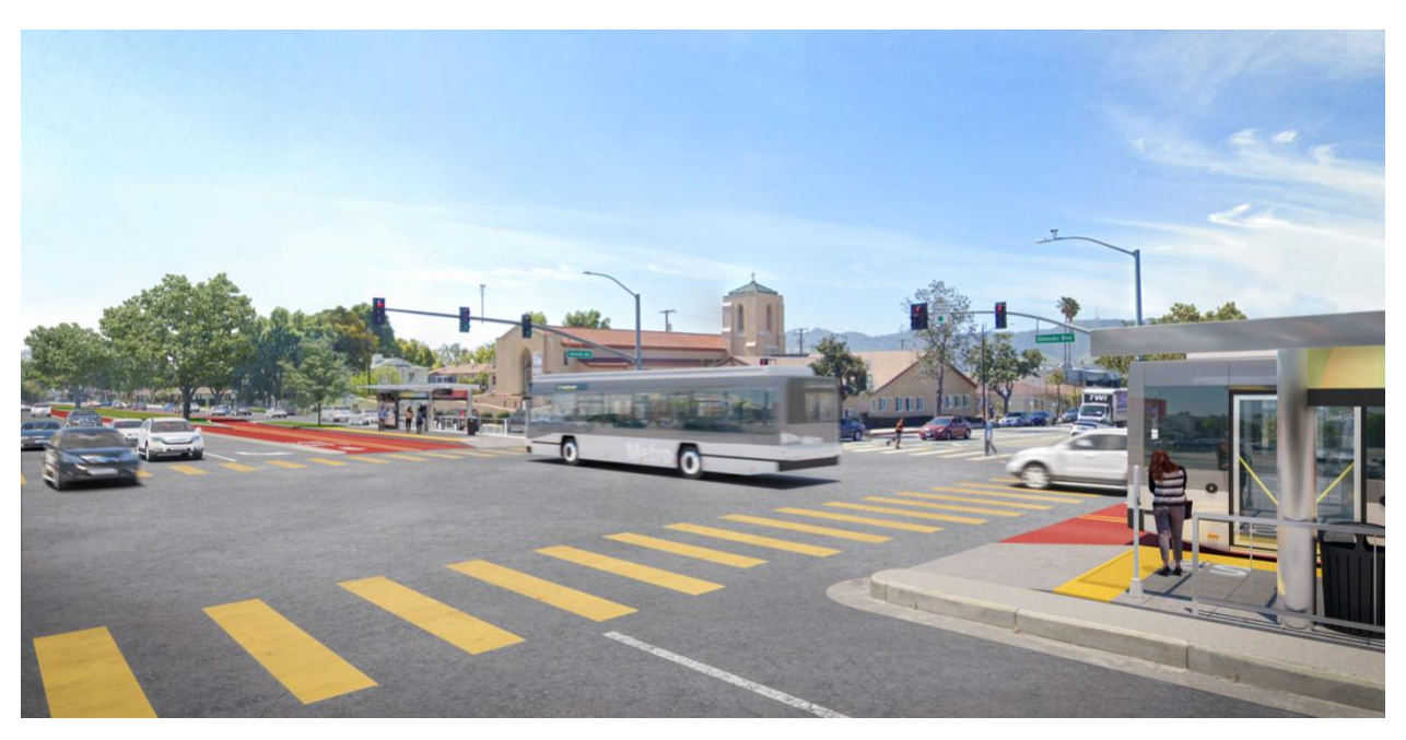
Figure 3: Center-running BRT on Glenoaks Boulevard in Glendale