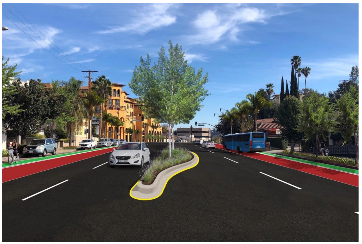
Figure 5: Side-running BRT on Colorado Boulevard at College View Avenue in Eagle Rock (west of Eagle Rock Boulevard)