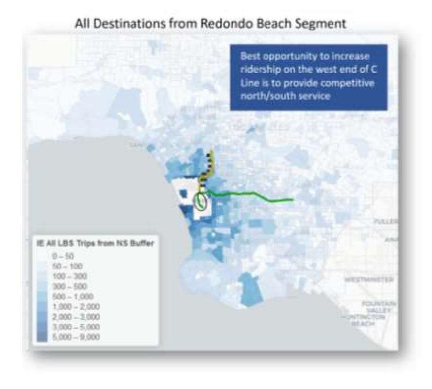
Figure 6: Redondo Beach Segment of C Line (Green) Overall Travel Patterns