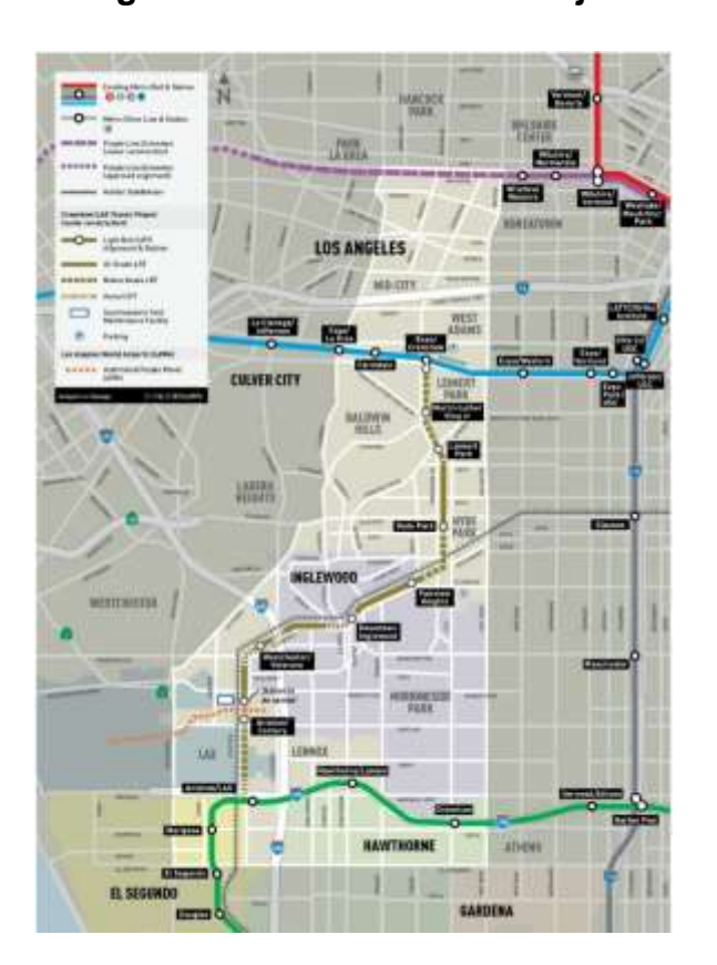
Figure 1 – Crenshaw Rail Project