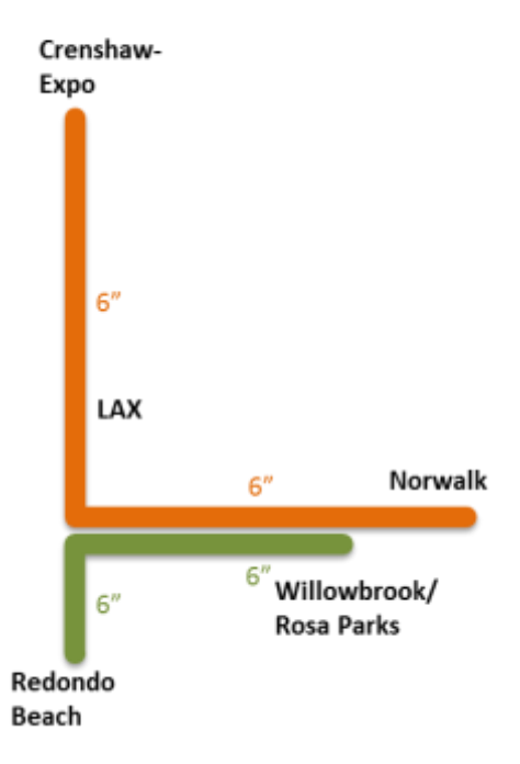
Alt C-3: Green Line shortline, Crenshaw to Norwalk