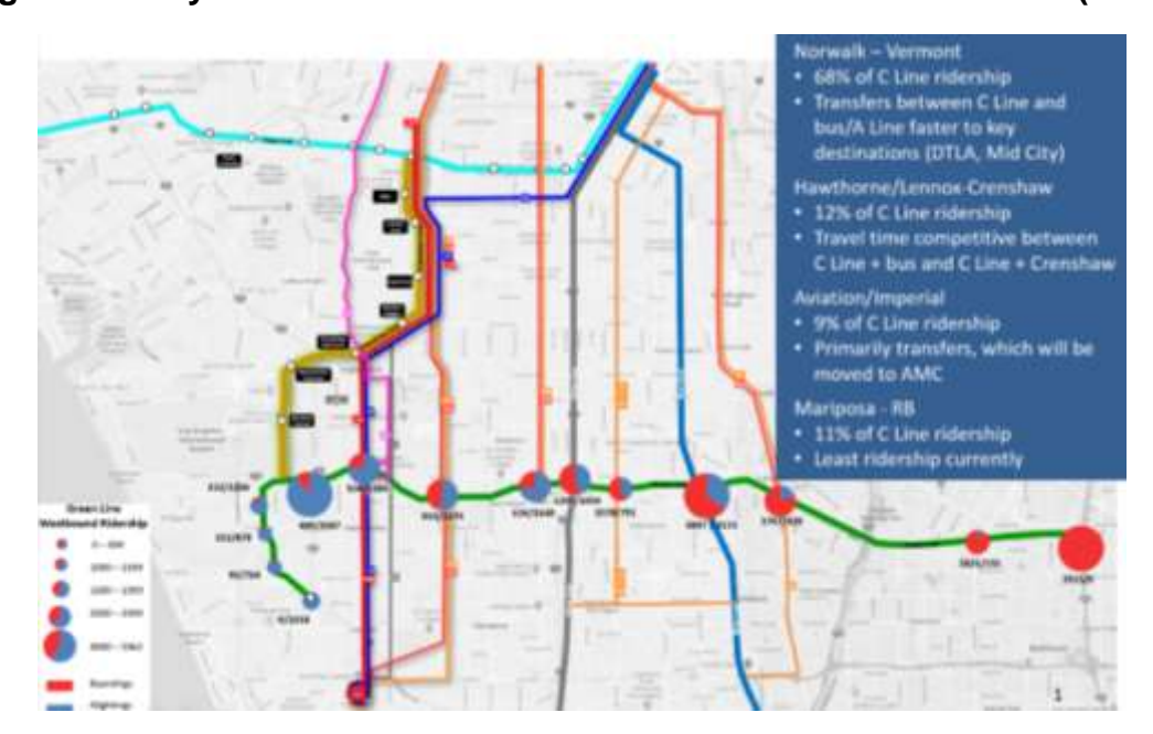
Figure 5 – Key NextGen and Rail Transit Connections from C Line (Green)