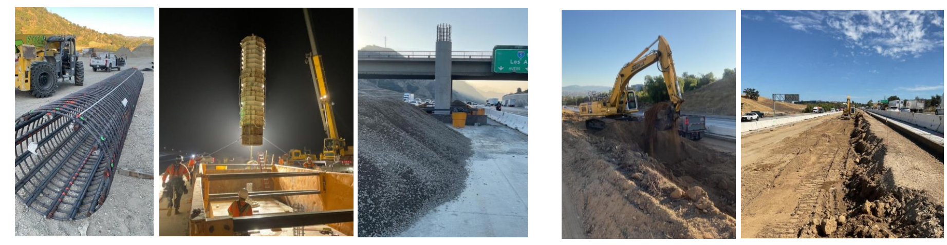
Erection of Column for new Weldon Canyon bridge

Median Excavation work for retaining walls in progress