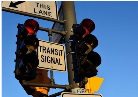
Transit Signal Priority