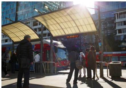
More Frequent Service