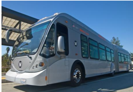
Electric Buses with All-Door Boarding