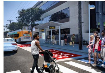
Peak-Hour Bus Only Lanes