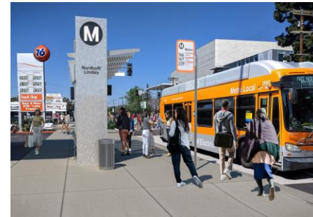
Enhanced Stops with Branding