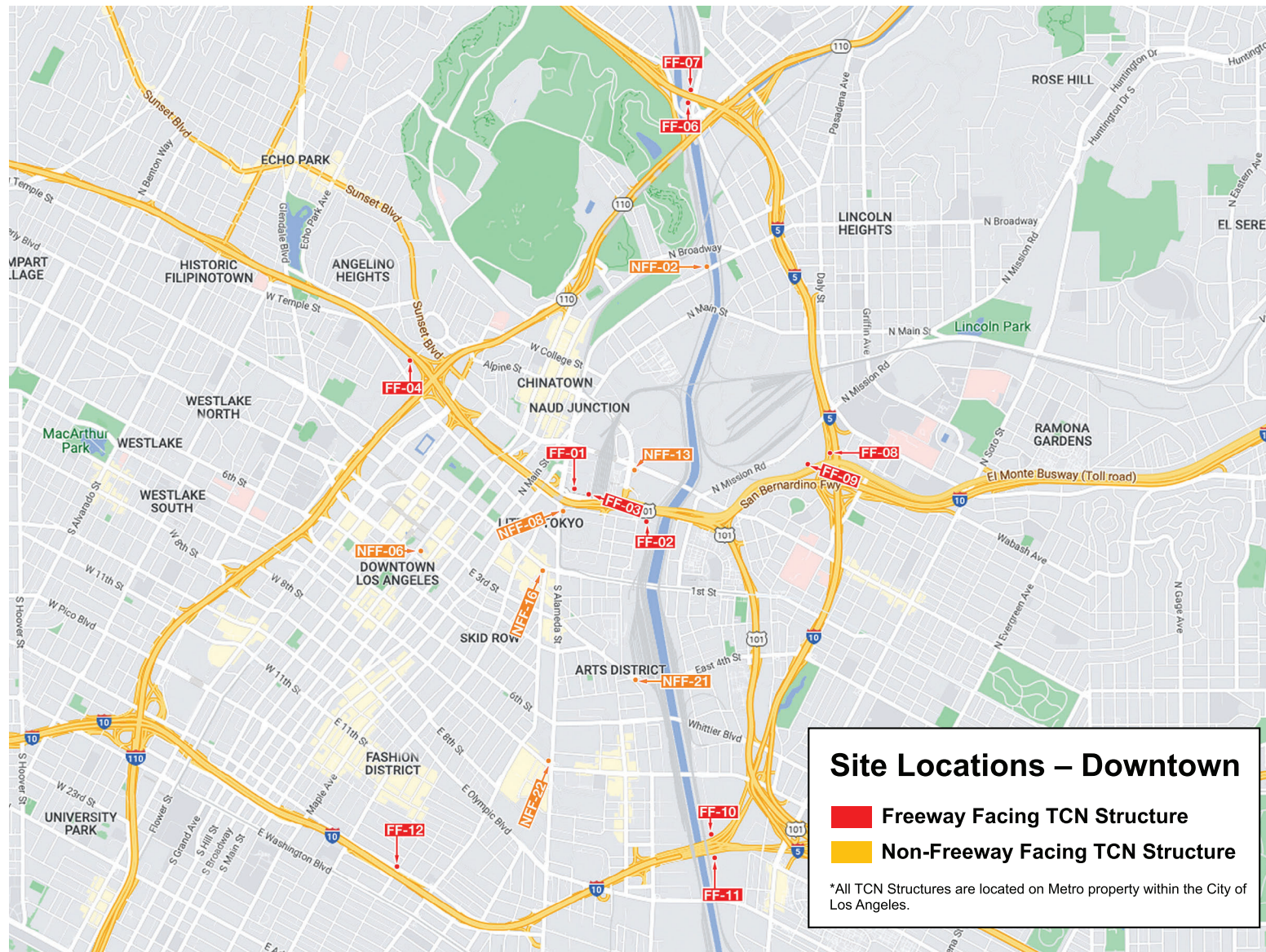
Figure -3 Regional Project Location Map – Downtown