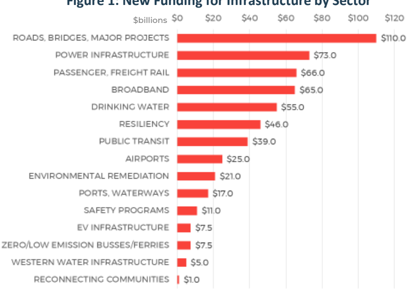
Figure 1: New Funding for Infrastructure by Sector

The IIJA emphasizes investments in equity and measures to mitigate climate change, while safety remains a top priority for the US Department of Transportation (USDOT). Many of the investments in the IIJA will be used to meet the Justice40 goals of Executive Order 14008 which aims to deliver 40 percent of the overall benefits of federal investments to disadvantaged communities that are marginalized and overburdened by pollution.<sup>2</sup>