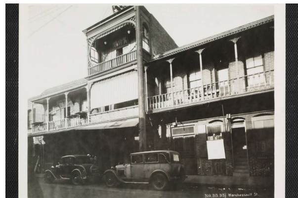
Man Jen Low Cafe at 309 1_2 Marchessault Street.