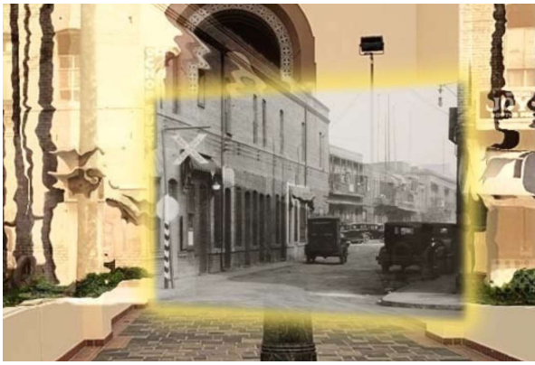
View of the present-day Union Station with image of the former Apablaza Street block overlaid via augmented reality.