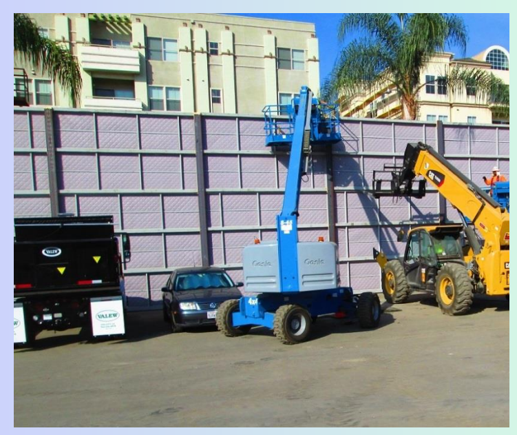
Installation of Soundwall Panels at North Wilshire/La Brea Construction Staging Site

Tunnels, Stations, Trackwork and Systems Design-Build Contract is 4% complete.