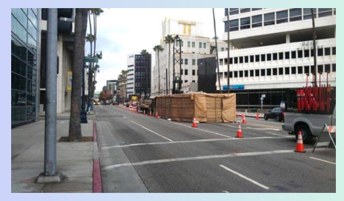
Geotechnical Drilling on Wilshire at Reeves