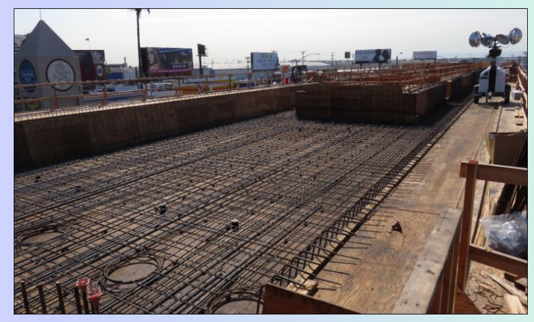
AVIATION/CENTURY BRIDGE - Rebar Installation