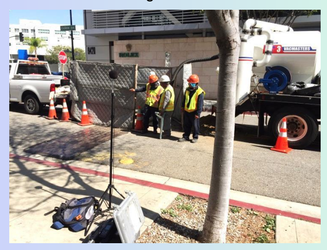
Potholing utilities near Wilshire/Rodeo Station site