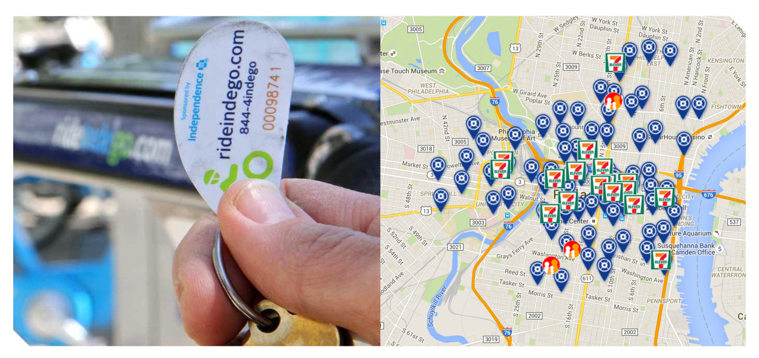
PayNearMe locations and Indego stations in Philadelphia.

Providing physical bike share keys, regardless of membership duration, may also encourage ridership. The key serves as a physical reminder that bike share is available and shortens time spent getting a bike. In Philadelphia and Austin, users sign up for an automatically renewing 30-day membership online and receive a key for use at any dock. In contrast, in Nashville, users sign up online for 30-day membership but must swipe their credit card at the kiosk each time to access a bike.